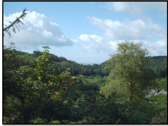
View from the forestry track looking down the valley to the sea

The hilltop, coastal location provides a climate of strong contrasts. It is exposed to South West onshore winds from the sea, and to cold northerly winds, but the existing coniferous tree cover provides effective shelter from these. This is one of many reasons not to fell too many of the conifers at once. The wind also affects the amount of work that can be done in the woods. e.g. It is too dangerous to do Forestry work in strong winds, so work plans have to be adaptable to weather conditions.